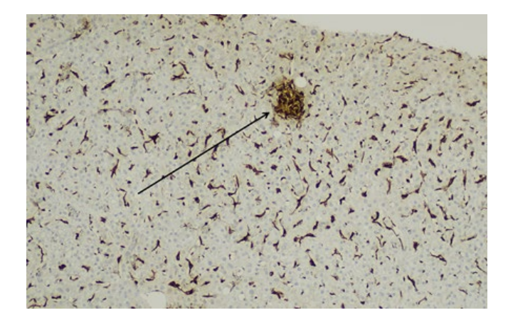
Figure 2 : A microgranuloma is highlighted by the CD68 stain (arrow), which also exhibits Kupffer cell hyperplasia (100x magnification).

She had a favourable evolution and was discharged after 2 weeks of hospitalization with a reinforced dietetic, exercise and insulin therapy plan. At 1-month follow-up she was asymptomatic, without analytical changes (Fig. 3).