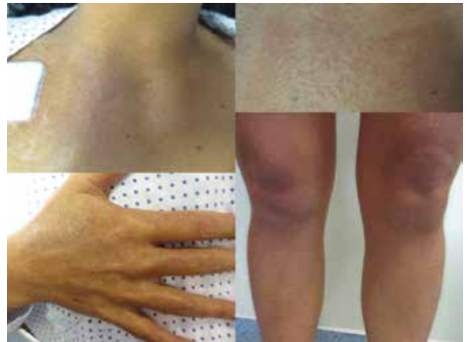
Figura 1: Multiple, grouped erythematous perifollicular micropapules on the trunk upper and lower limbs

Serviço Dermatovenereologia, Hospital dos Capuchos - Centro Hospitalar Lisboa Central, Lisboa, Portugal